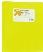
2- Pocket Folder Need: (1)