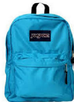
Backpack (No rolling backpacks please!)