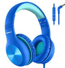
Headphones NO EAR BUDS Need: (1)

Girls - one box of Ziploc sandwich bags Boys - one box of Ziploc gallon bags Everyone- 2 boxes of tissues No book bags with wheels