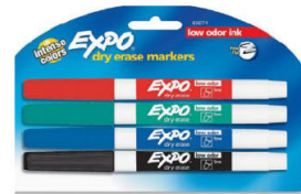
Dry Erase Markers (fine tip) Need: (2) pack