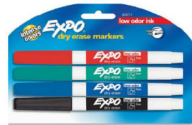
Dry Erase Markers (fine tip) Need: (2) pack