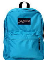
Backpack (No rolling backpacks please!)