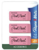
Erasers Need: (1) pkg of 3