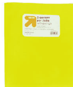
2- Pocket Folder Need: (1)